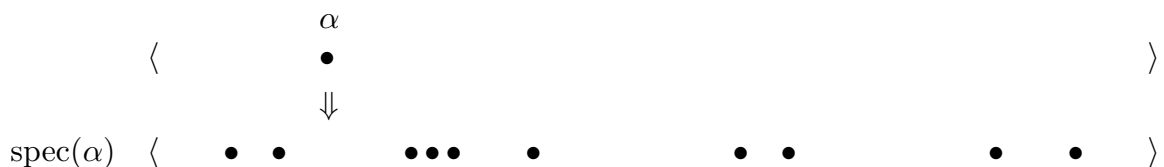
Figure A. Each real number \alpha determines \text{spec}(\alpha) , a countably infinite subset of the reals.